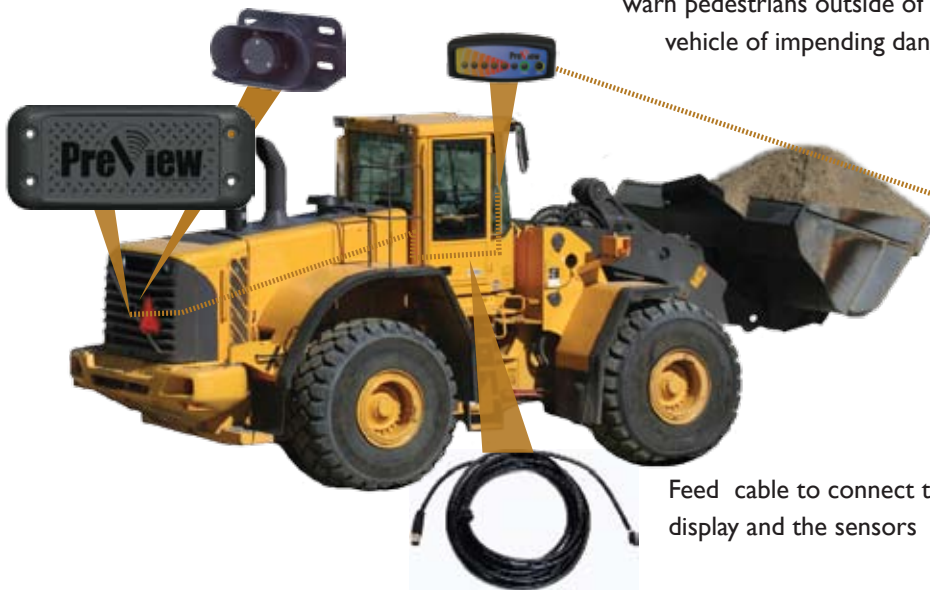
Feed cable to connect the display and the sensors